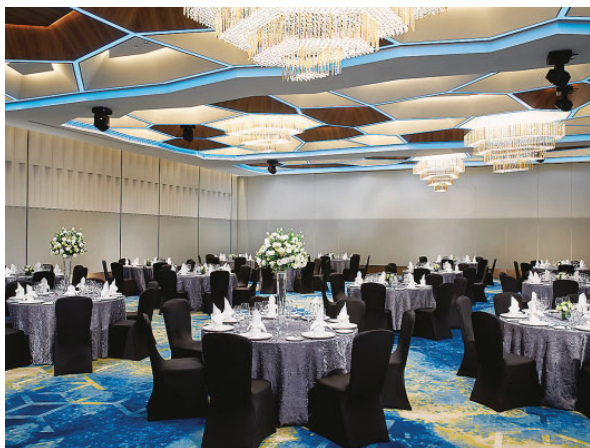
The Pacific Ballroom set up for a corporate dinner

www.concept-systems.com.sg www.panpacific.com/singapore