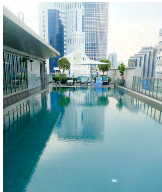
Underwater audio is provided by 10 EV UW30 speakers