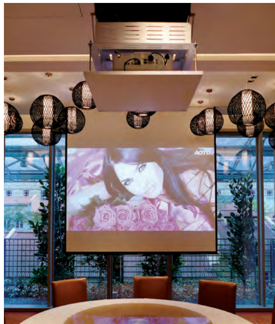
Eiki DLP projectors and LAV Hariz screens in the function room