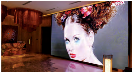
Guests are greeted by an LED display of 112 AOTO tiles