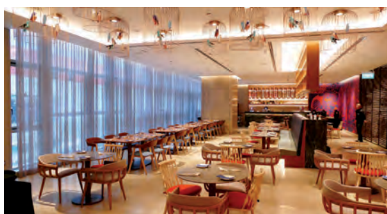
EV ceiling speakers provide ambience in the dining area